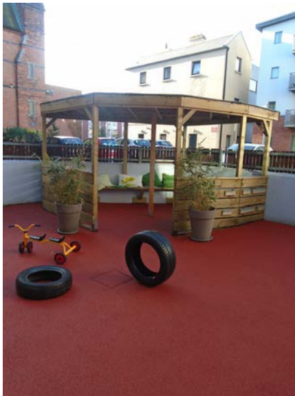
The new soft play area installed in Cork St in 2019

In our dedicated Nurturing Centres in Donabate and Cork St, Sophia provides support to the families living in Sophia tenancies. We also provide support to families living in emergency accommodation through our Outreach Services.