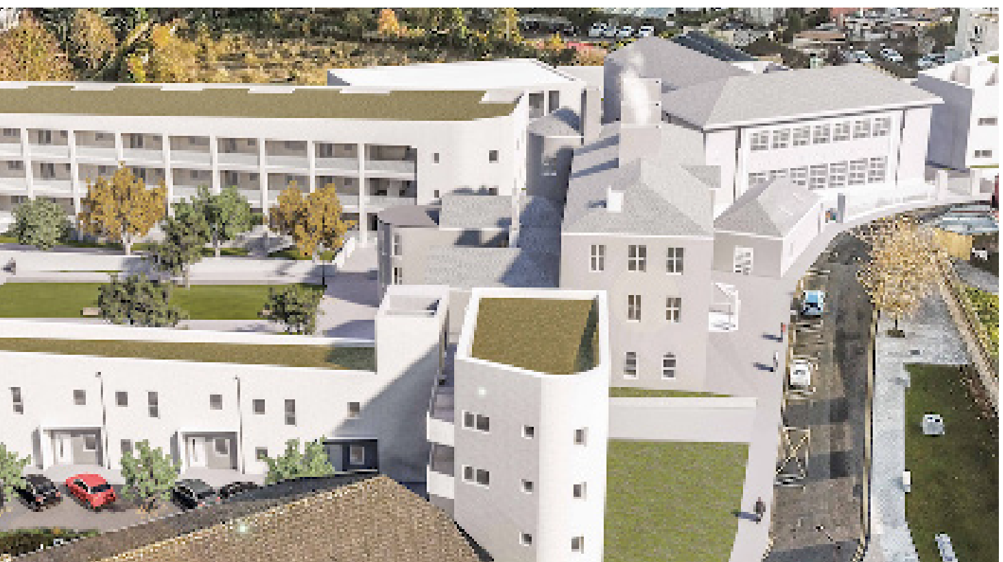
Architectural Drawings of Sophia's Project on Church Ave Portlaoise

The blueprint for this project was created when Sophia worked with the Sisters of Mercy converting lands and buildings in the heart of Dublin 8 into homes with support. Portlaoise and Cork St are emblematic of a number of other projects Sophia is working on with Congregations across the country, such as the Sisters of St Paul the Apostle in Kilfinane, Co Limerick where together we hope to provide 9 homes with support. In Kilkenny the Sisters of St John of God have partnered with Sophia to develop plans to create 12 new supported homes. These Congregations see in Sophia shared values and a conduit for their social justice legacy.