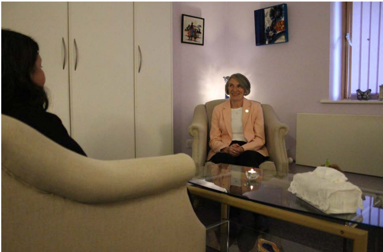
Therapeutic space in Sophia Wisdom Centre