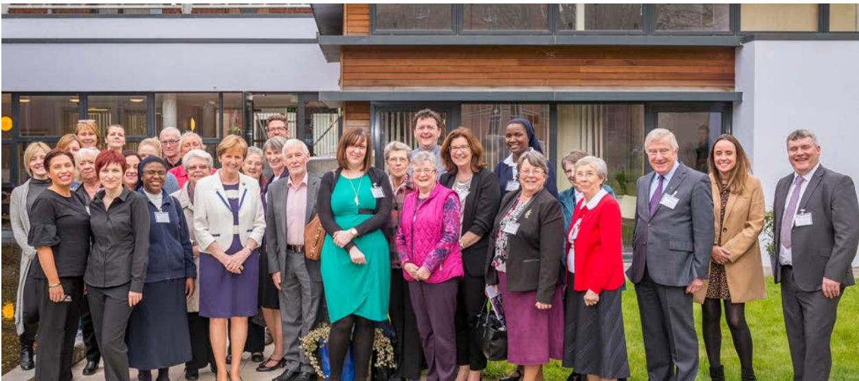
Sophia Staff and Supporters Gathered at the Wisdom Centre

The agreement is an example of an innovative partnership, how two organisations who are committed to similar goals and share the same philosophy in terms of service provision can support more people.