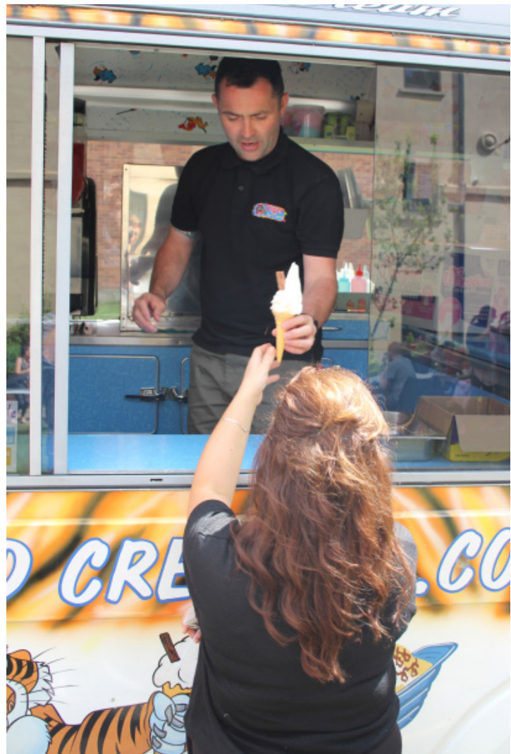
Residents Summer BBQ 2019

In 2019 Sophia, in partnership with Cork County Council, began a Tenancy Support Service.