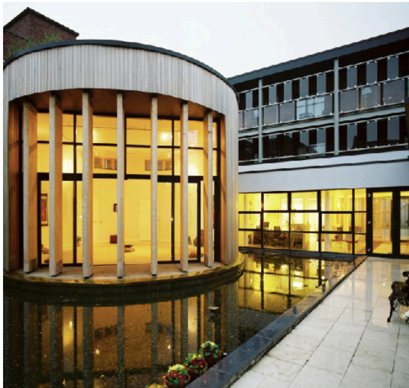
Wisdom Centre Cork St