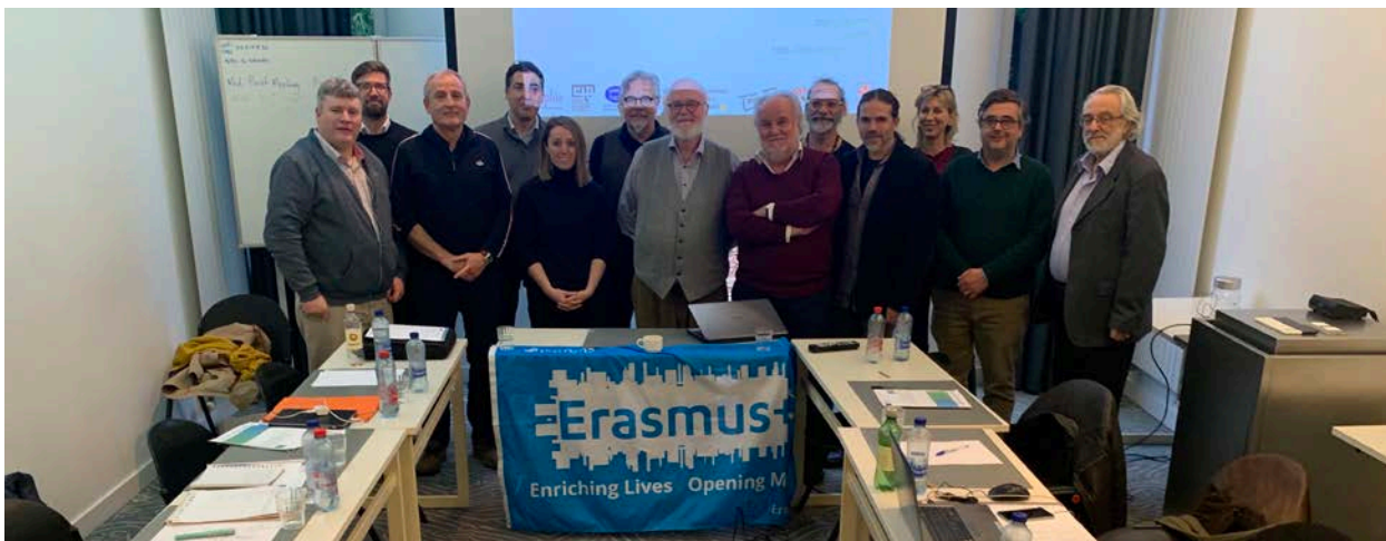
Erasmus+ Partners first meeting in Belgium Dec 2019

One of the key outputs from the project was the publication of a front workers manual on Practical Approaches to Working with Homeless People with Mental Health Problems which was co-written by Sophia. This manual selected Sophia's service in Sean MacDermott Street as an example of a European best practice service and was profiled in the manual. The manual has been translated into 8 languages and published in 8 countries.