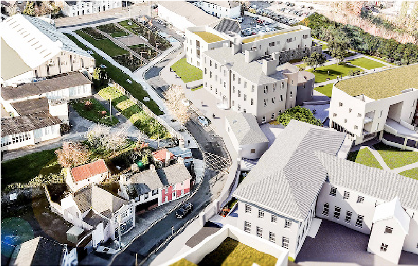
Architectural Drawings of Sophia's Project on Church Ave Portlaoise

For 192 years the Presentation Convent on Church Ave has been a central part of the community in Portlaoise. The Presentation Sisters, who moved their school to a new site, have been working with Sophia for a number of years to ensure that the buildings and lands remain central to the life of the town. They have been working with Sophia to reopen the doors of these historic buildings as homes with support for those who need them locally.