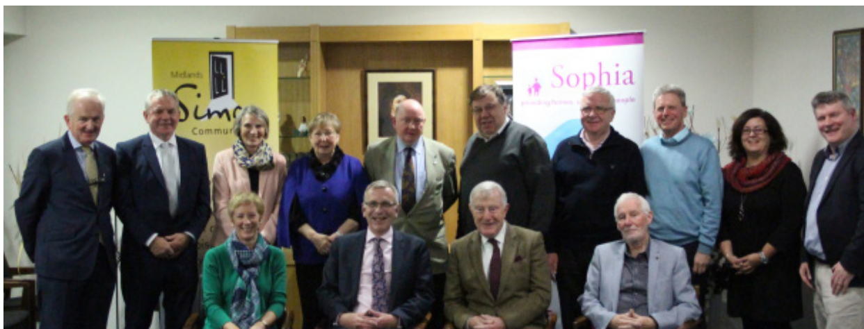
Board members of Sophia and Midlands Simon at a meeting held in Sophia and MSC joint offices in Presentation House Athlone

In October 2019 Sophia was invited to present at the Association of Leaders of Missionaries and Religious of Ireland (AMRI) Autumn Conference. This was significant in that it highlighted the strong partnership that exists between Sophia and the Religious Congregations who partner with Sophia to support those impacted by homelessness