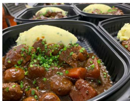
Meals prepared for residents in Cork St